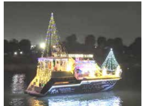
VENICE BOAT PARADE 2025